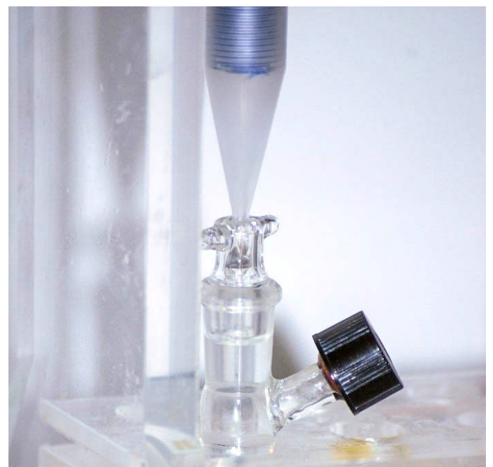
Figure 1: MicroRespiration setup showing a Unisense oxygen microsensor (OX-MR) inserted into a MicroRespiration glass chamber containing the 4T1 cells. The different substrates were injected through the rubber cup with a Hamilton syringe.

Conversely, to evaluate the uncoupled oxygen consumption, 5 μM nigericin plus 10 μM valinomycin were added to the cells before the addition of substrate. As respiration inhibitors, 10-50 μM rotenone to inhibit Complex I and 50-100 μM antimycin A to inhibit Complex III were employed. When the respiration was evaluated in the coupled condition, also 10-50 μM oligomycin could be used as an inhibitor of oxygen consumption. No more than 0.05 ml of the substrates were injected into the chamber.