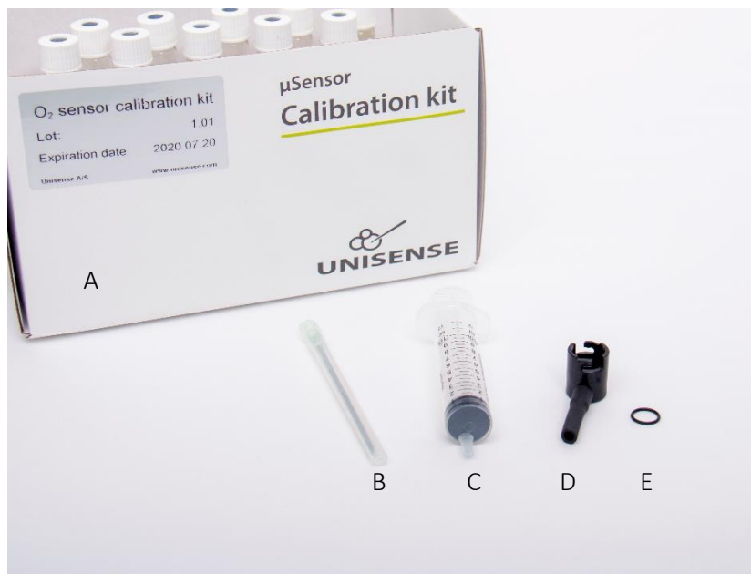
Figure 1: Calibration kit contents: A: Calibration kit box with Exetainers, B: 80 x 2.1 mm needle (green), C: 10 ml syringes, D: Calibration Cap with tubing, E: O-ring.