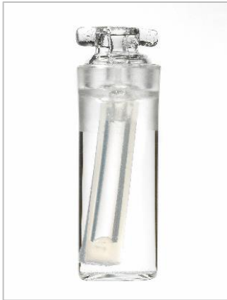
Figure 4: Zero calibration chamber (MR-Ch 0-calibration). The zero solution is outside the silicone tubing and pure water is inside. The oxygen in the water inside the tubing diffuses through the silicone tubing into the zero solution where it is consumed.