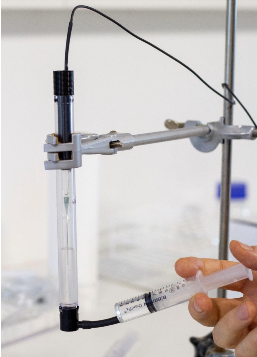
Figure 2: Oxygen microsensor with the calibration cap mounted. Calibration solution is injected with the 10 ml syringe.