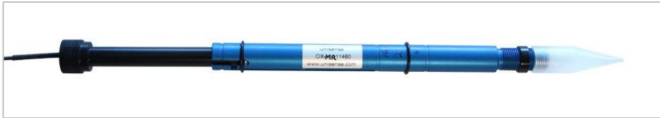
Figure 3: Oxygen sensor in the Microrespiration guide.