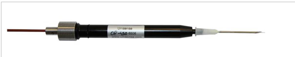
Figure 5: Optical oxygen sensor, Optode, in the Retractable Needle design.

NOTE: Before calibrating optodes, the optical fibre must be extended maximally out of the needle. This is done by pushing the inner steel cylinder into the black shaft.