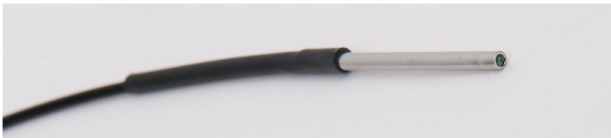
Figure 6: Optical oxygen sensor, Optode, in the Opto-3000 design.